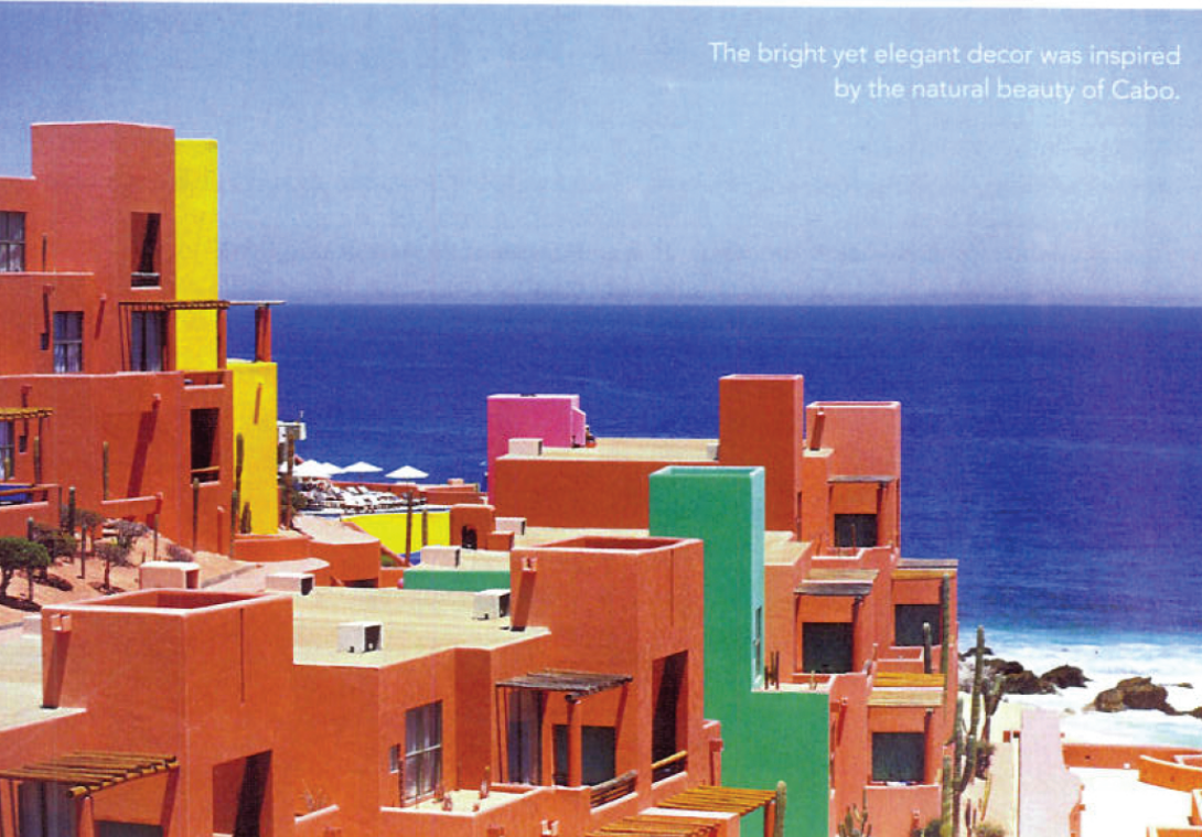
The bright yet elegant decor was inspired by the natural beauty of Cabo.