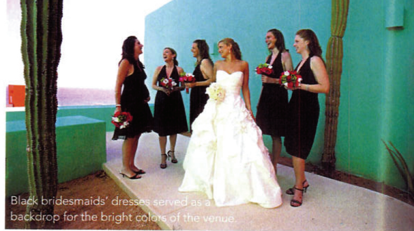
Black bridesmaids' dresses served as a backdrop for the bright colors of the venue.