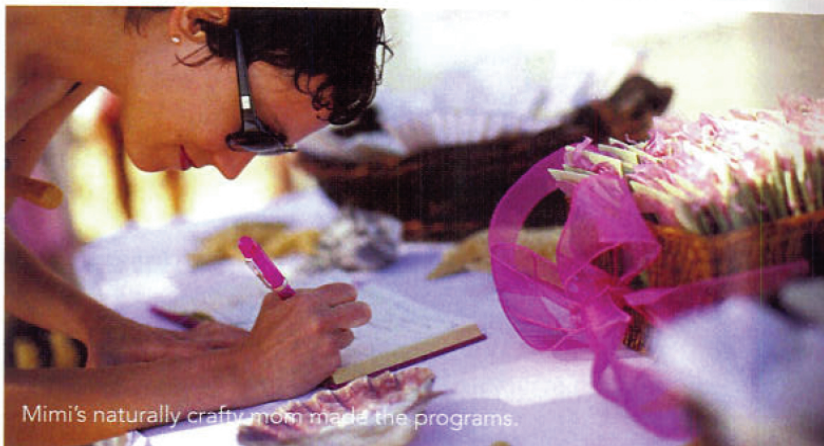
Mimi's naturally crafty mom made the programs.